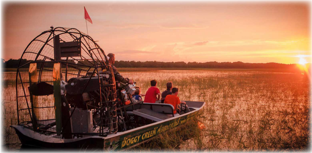
Prices and entitlements are subject to change without notice. All sales are final.